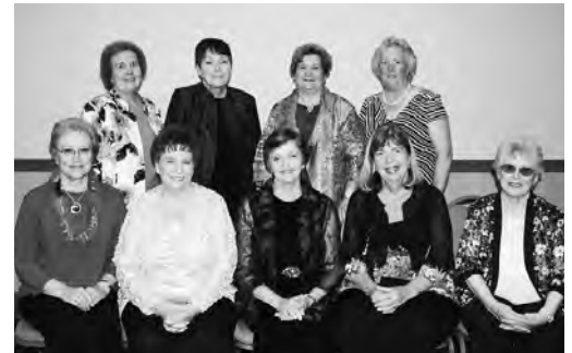
2011-2013 Executive Committee