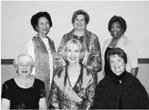
Past Chi State Presidents