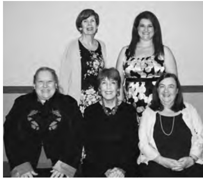
Convention Steering Committee