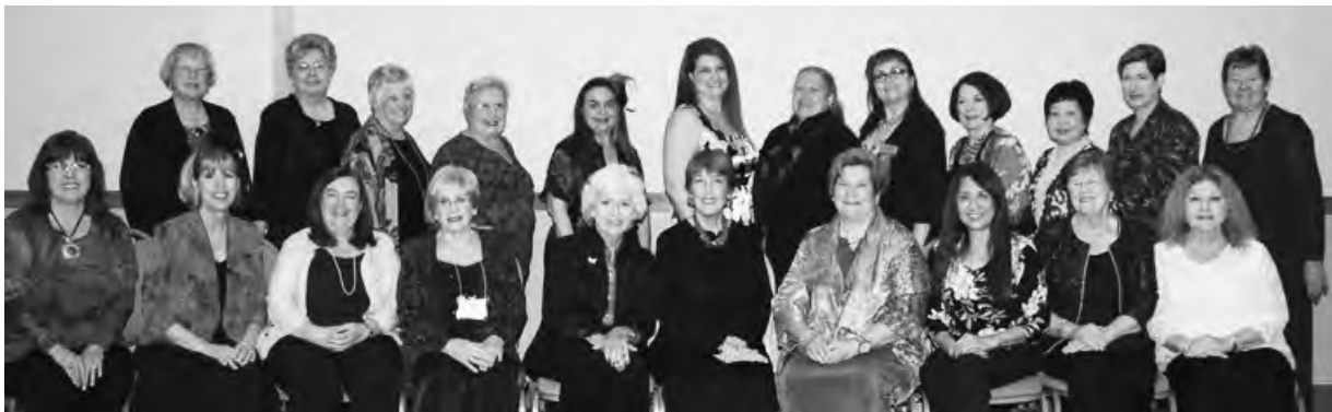
Chi State Convention Local Arrangements Committee