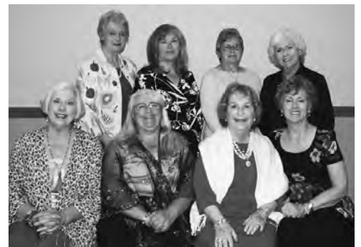
LIFE Foundation Board of Directors