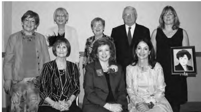
Distinguished Service Award Recipients/ Personal Growth and Services Committee Members