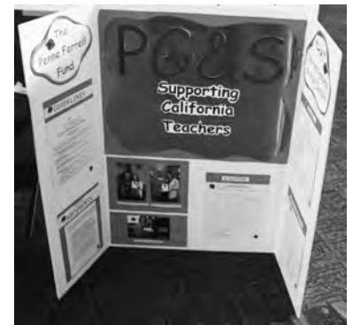
Personal Growth and Services Committee Display