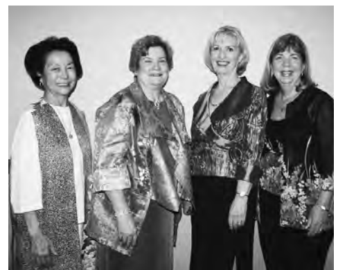
Chi State Members Serving International