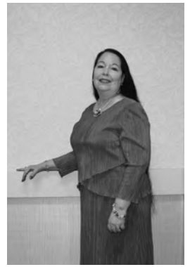
Convention Local Arrangements Committee Members