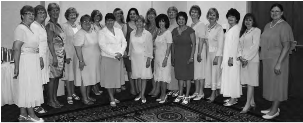
Chi State Area Directors gather at the Celebration Ceremony of Life at Chi State Convention