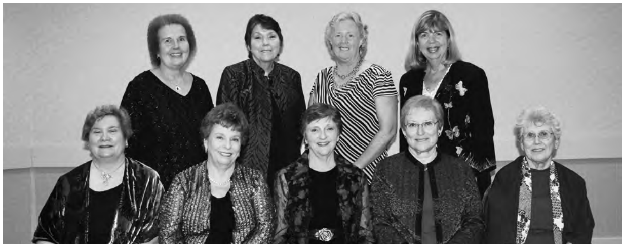
Chi State Executive Committee: